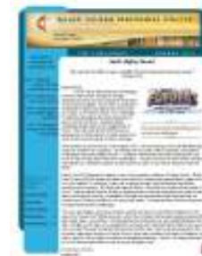
Read the Challenge