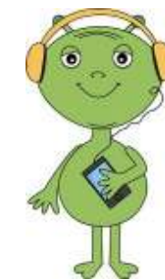
Listen to a Sermon