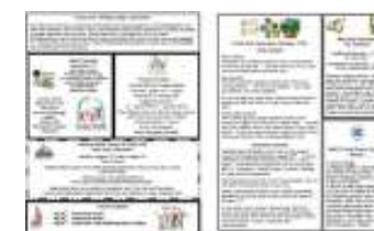
Look at Announcements