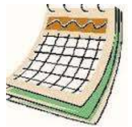
Check the Calendar