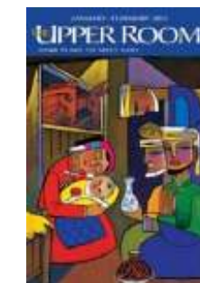
Do daily Devotions